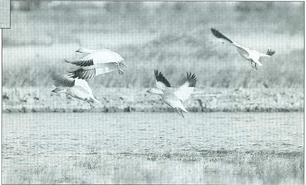
RIGHT: Generation after generation, these snow geese will return to dependable feeding areas. Huge flocks can be hard on croplands.