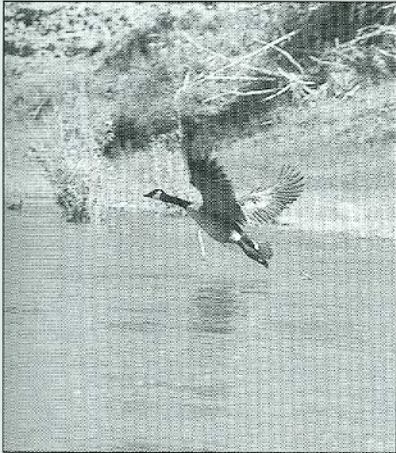
ABOVE: Canada goose over the Crooked River. Good pass shooting can be had on riverways, especially after ice closes lakes and ponds.

The General Fall Seasons are held between early October and early to mid-January, depending on which